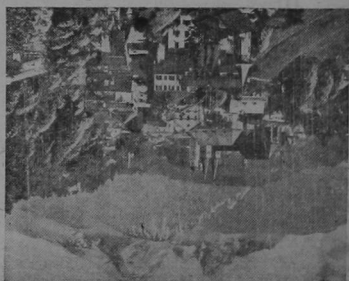
BERCHTESGADEN, the Bavarian village where Adolf Hitler has his hide-out.

In the last five years British taxpayers have contributed more than twenty-four million dollars by way of grants - in aid to Malta to make up for the Island's excess expenditure over revenue. From official figures, the highest grant was during the siege in 1942-1943, totalling $9,000,000. A special extra grant of $43,800,000 was also made, for the construction of rock shelters. In addition, annual subsidies for essential commodities since the outbreak of war, totalled $4,816,000. Some 74.3 per cent of the Island's war expenditure came by way of Imperial grants.