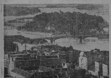
Aerial view of Budapest, Hungary, Capital occupied by the Red Army in February

UNRRA's task with "Displaced Persons" constantly develops new problems, but these are being met swiftly in this period of chaos and confusion which the Nazis boasted they would leave as a heritage if they were defeated.